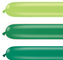
Q160-89 Lime Q160-22 Green Q160-52 Emerald 5-7 of any or all of these 160Q Latex Balloons