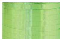
B31696 Curling Ribbon