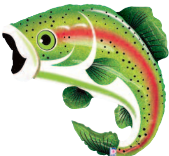
77091-26 26" Foil Balloon