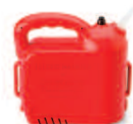
829 Twist-N-Flate™ Inflator