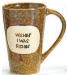
987567 1-ea Mug Asst.