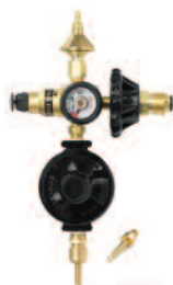
BR74HG Dual Foil + Latex Regulator